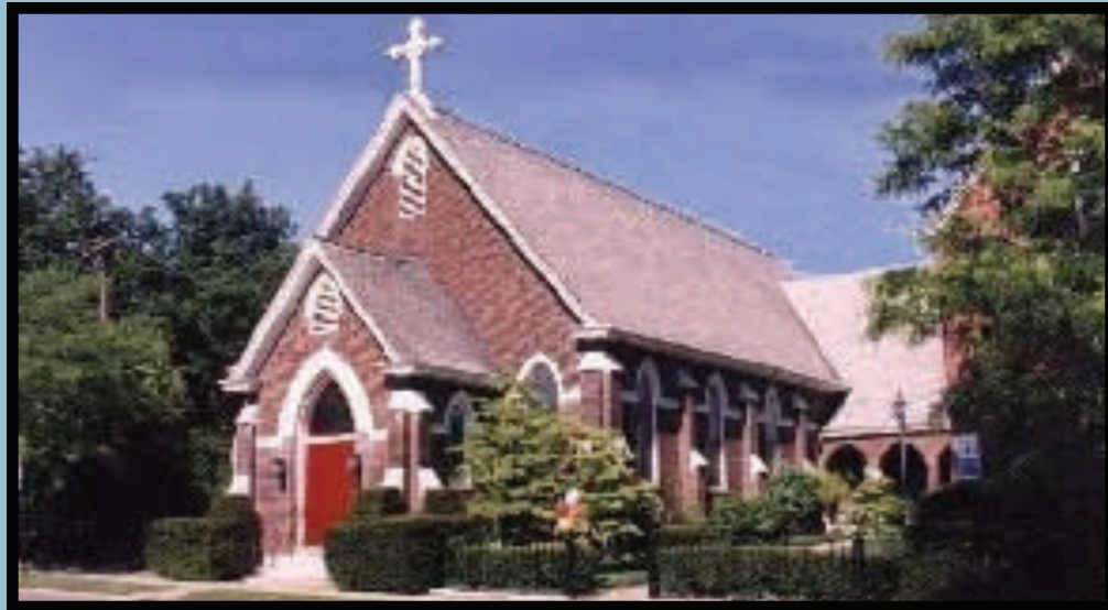
St. John's Episcopal Church 210 North Main Street Versailles, Kentucky 40383